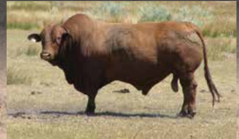
Texoma bulls covering the country in the high desert of Oregon.

Don't take chances! Get the most from your bull buying dollar. Buy your next bull with proven performance numbers.